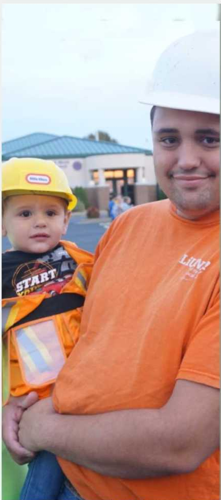
FREE LIFE INSURANCE