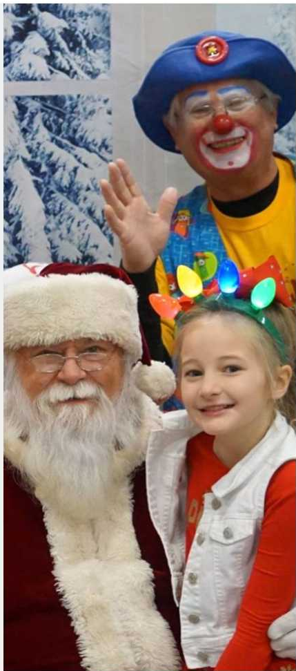
FAMILY PARTIES AND EVENTS