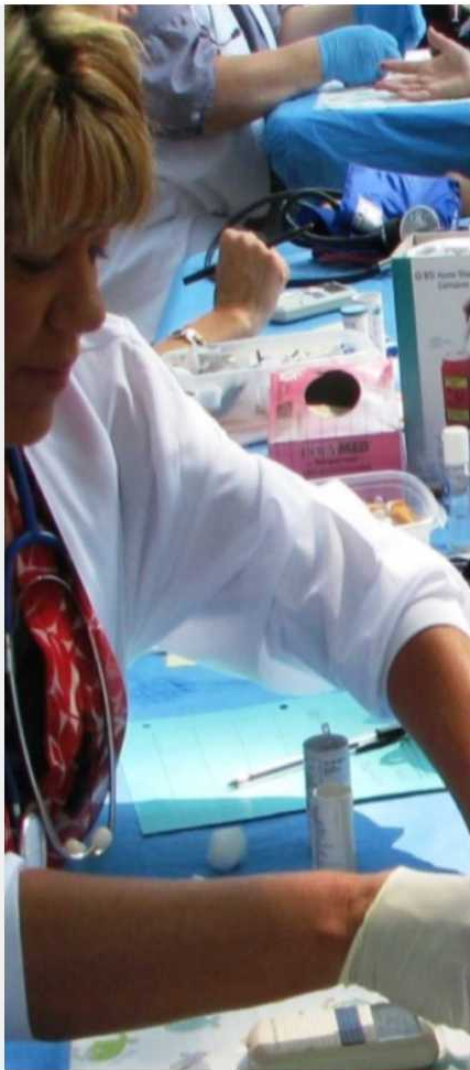
ACCESS TO HEALTHCARE & PRESCRIPTION DRUG DISCOUNTS